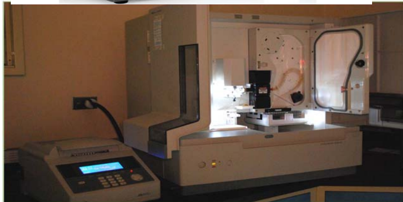
(Genetic Analysis) DNA Sequencer3310 DNA (2)