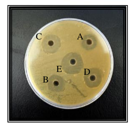
Fig. (2) : The antibacterial activity of Trigonella foenum leaves against Salmonella typhimurium