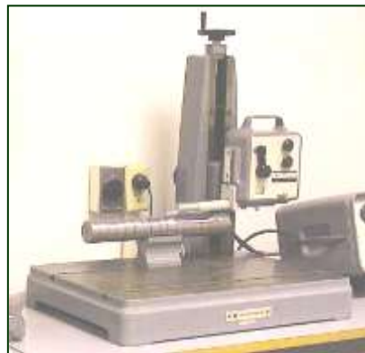
Figure (3): TALYSURF4 machine used to measure surface roughness

Maximum distance can be moved (11 mm), with horizontal magnification (4X → 100), vertical magnification (500X → 100000) as shown in figure (3).