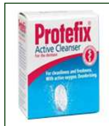
Figure (1): Denture cleansers (Protefix active)