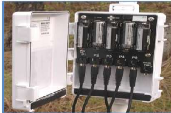
Figure (4): Em50 Data logger manufactured by the American company Decagon Devices

The device needs a very small power supply of 30 mA when the sensor is connected to the SDI-12. This box is programmed with Utility ECH2O, through which data can be stored and transferred to the computer, which in turn supports computer programs through which data can be represented through the 3 Data Trac program to draw and represent data during the