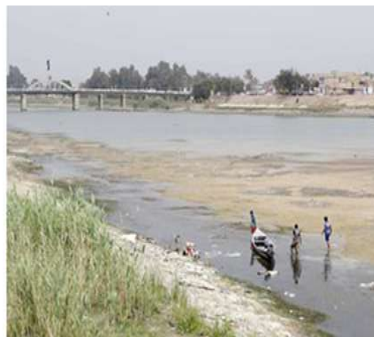
Figure (1): Low river levels for different regions of Iraq

There are many uses of water, as it is used in human, health, and industrial consumption, in addition to its uses in irrigation, which increased the demand for available water resources, including groundwater, which is the strategic reserve store of water, so the scheduling of irrigation for the purpose of achieving rationalisation of its use has become an urgent necessity, Since the scheduling of appropriate irrigation is the most important factor for crop