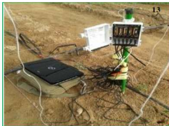
Figure (5): Installing sensors used in scheduling irrigation in one of the greenhouse fields