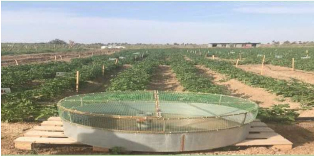
Figure (7): Evaporation basin used to determine the irrigation date in a research experiment [20]

Third: indirect or estimated methods Various mathematical equations and formulas were used to estimate evaporation and transpiration from climate data, such as :