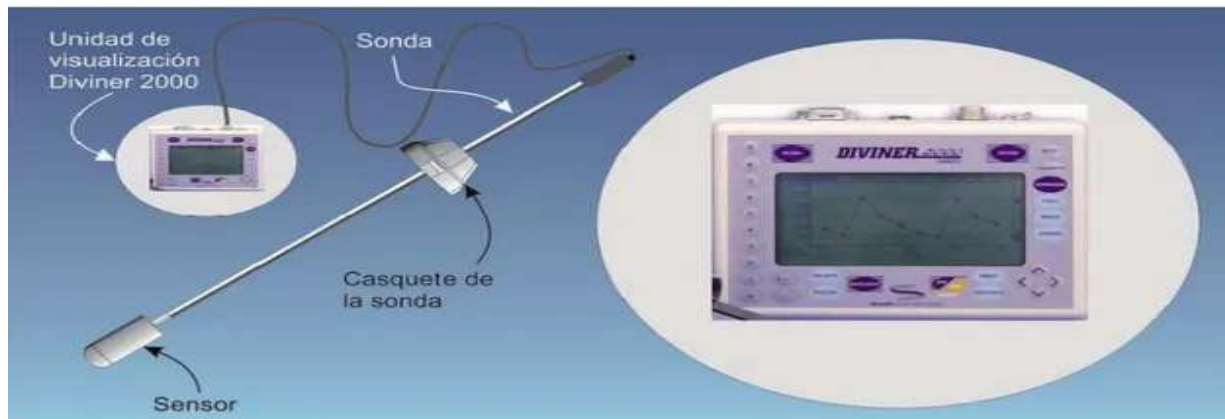
Figure (6): Diviner 2000 Parts

After the volumetric soil moisture (0.23) is determined by one of the methods referred to above, the depth of water added in each irrigation is calculated. When relying on the method of soil moisture studies, and assuming the depth of the root zone ( D = 30 cm), the following equation is used as mentioned in [31].