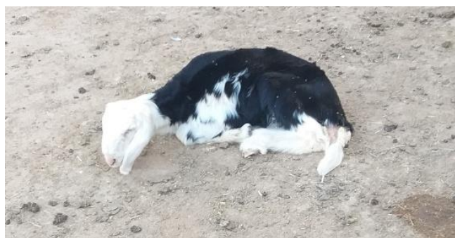
Figure 5: A 3-month-old female lamb of the Najdi breed had a deficiency of vitamin D3, showing marked depression, poor body and hair condition, and recumbency.