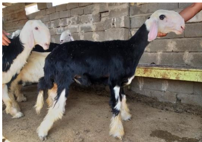
Figure 4: A vitamin D3 deficient eight-month-old male sheep of Najdi breed had marked enlargement of joints and metatarsus bone (right) bending with poor hair and body conditions.