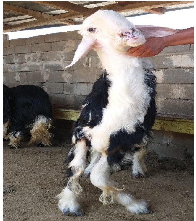
Figure 3: A ten-month-old male sheep of the Najdi breed had a deficiency of vitamin D3, showing marked enlargement of joints and bending of metacarpus bone (left) with poor hair and body conditions.

When examining lambs suspected of deficiencies in vitamin D3, several clinical manifestations were noted, including a decreased body condition score and ruminal motility (Figures 1 and 2), a decreased weight gain, signs of rickets, lameness, loss of appetite, poor hair coat condition, enlargement of joints, bending of large bones (Figures 3 and 4), recumbency (Figure 5), diarrhea, pale mucous membrane, congested mucous membrane, nasal discharge, lacrimation, coughing, dyspnea and decreased ruminal motility. The results of clinical signs and symptoms are listed in table 3 for animals suspected of vitamin D3 deficiency.