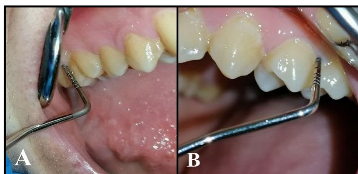
Figure (2): (A) Measurement Loss of Attachment in Upper Right First Molar (B) Measure Loss of Attachment and Pocket Depth in Upper First Premolar.