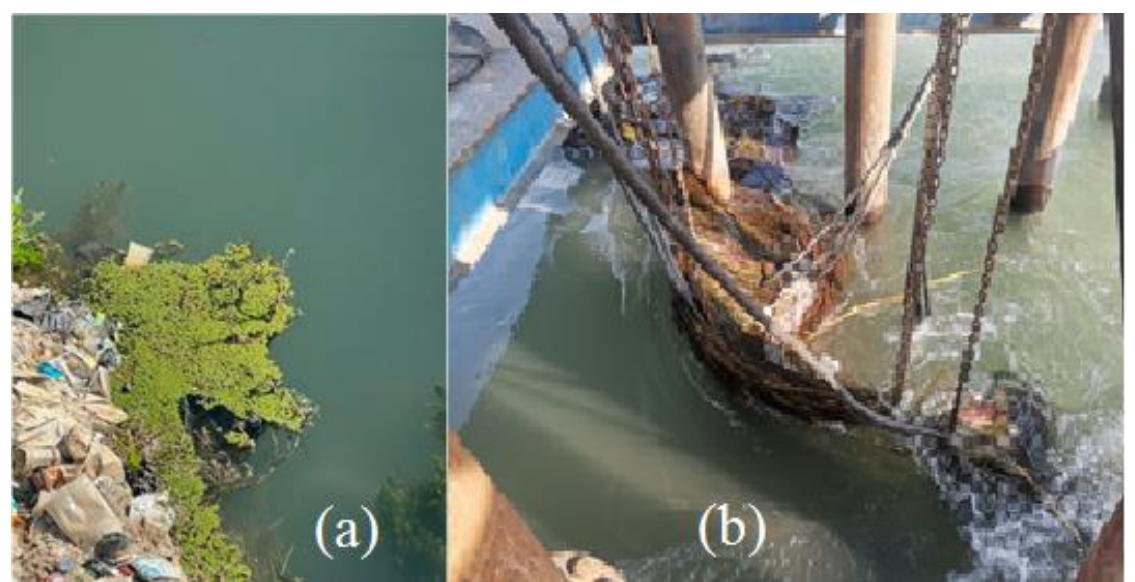
Figure (2): habitats of (a) Azolla filiculoides; (b) Hydrilla verticellatum

The specimens were identified depending upon the keys and description mentioned in: