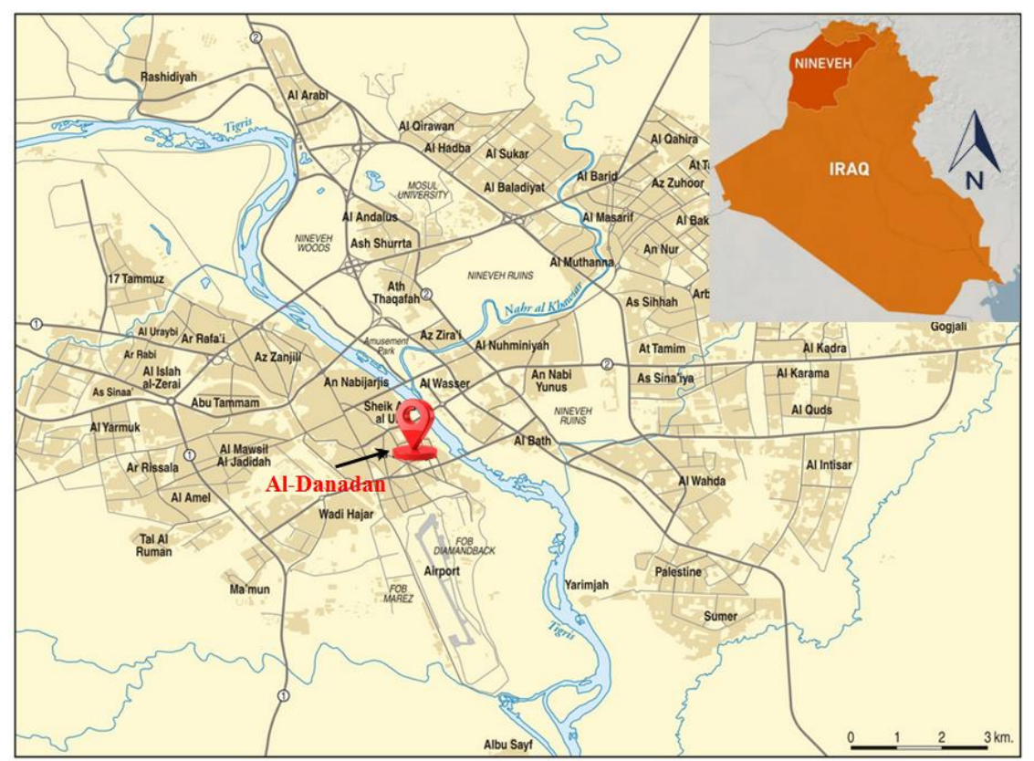
Figure (1): Mosul city map showing location of specimen (Modified from://www.wpmap.org/wp-content/uploads/2017/03/Mosul)