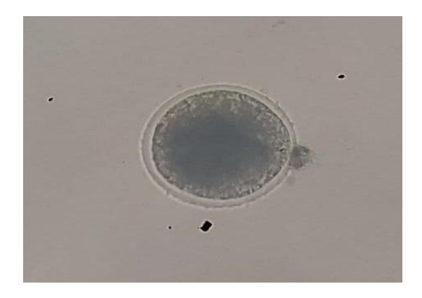
Appearance of the first polar body