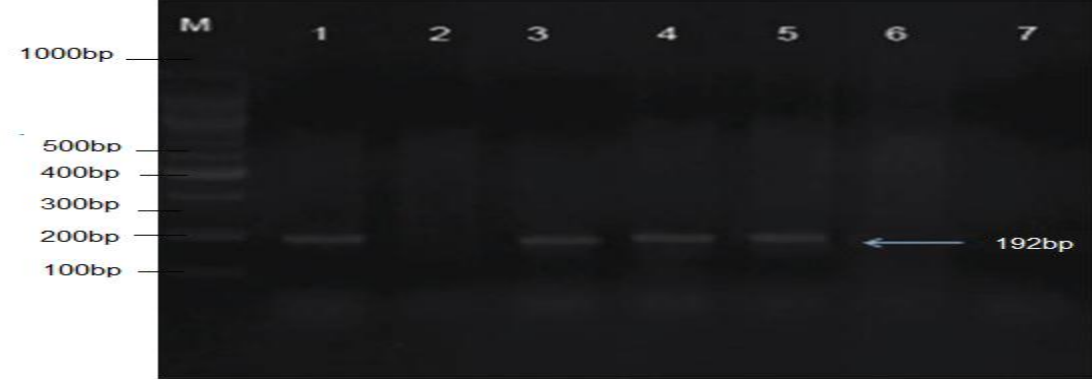
Figure 4.2: PCR result