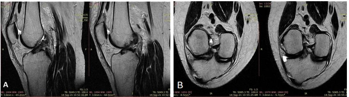
Figure 3: 29 years old male patient presented with popping sensation then severe right knee pain while playing football. A) Two sequential Sagittal T2W-TSE images showing thickening and swelling with abnormal SI involving the mid-portion of ACL with a retracted proximal segment. B) Two sequential coronal oblique T2W-TSE images confirm the abnormal SI that involves the full thickness of mid-portion of ACL in keeping with a complete ACL tear.