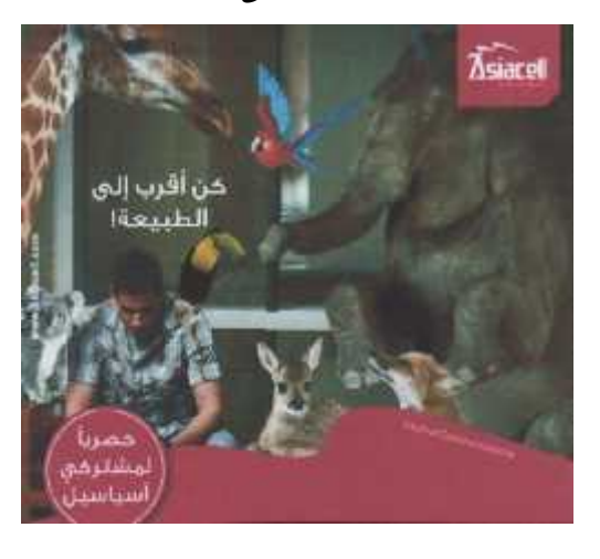
كن أقرب إلى الطبيعة

a dozen of other meanings (and shades of meanings) can be inferred depending on one's conceptualization of the different elements of the ad. Therefore, this ad reveals a number of meaning exemplars that are strongly associated with it, i.e., the relationship between the two components of the unified signs: signifier and signified: distinctiveness, activity, dynamism, status, ecology, congruity, complementarity, and to a certain extent, a sense of escapism. The degree of explicitness or implicitness of these exemplars differ; however, overlap prevails!