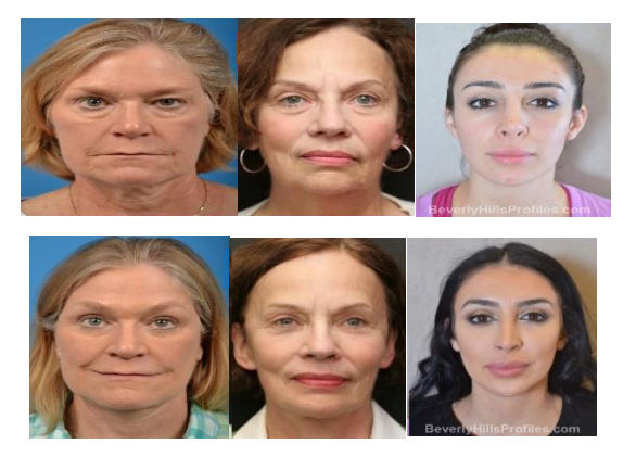
Figure 1. Shows pictures of people before and after plastic surgery

whom the plastic facial surgery database is unavailable due to privacy concerns. Without access to surgery information, predicting static features (Areas without surgical effects) is very challenging. Cosmetic surgery may additionally be used for persons who attempt to conceal their identity to engage in or evade the law. The current face recognition algorithm effectively extracts a feature from an image. This procedure also makes it possible to steal freely without worrying about being recognized by a facial recognition system, which could result in the rejection of actual users. Fig. 1 shows an example of the effect of plastic surgery on facial appearance resulting from plastic surgery (before and after pictures of plastic surgery).