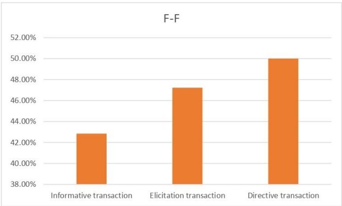
Figure (2) Frequencies and Percentages of Transactional Types within the same-Sex (Female-Female) Interaction.