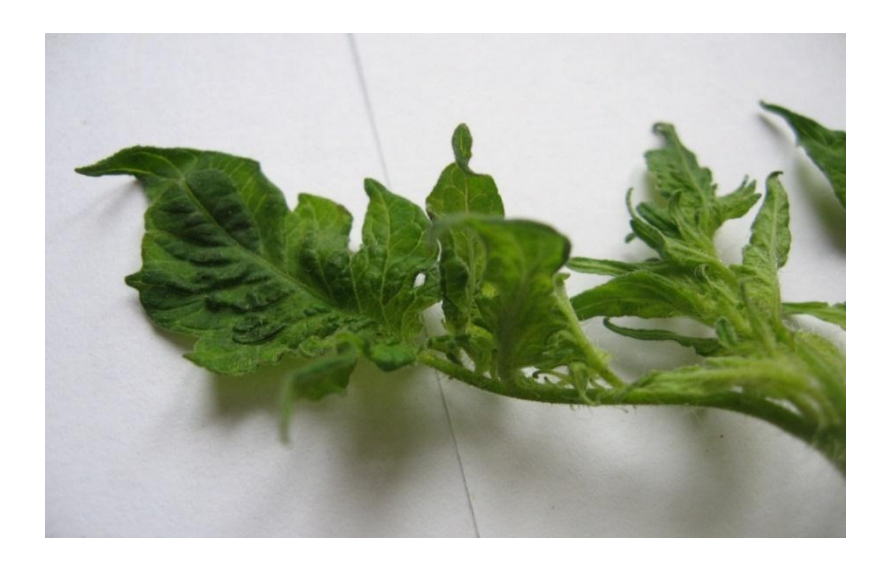
Fig. 2: The symptoms of mosaic and deformation in the tomato plants infected in the field with tobacco mosaic virus

Samples of infected leaves of tomato plants showed mosaic symptoms and deformation were collected from tomato fields in AlRasheediya and Wanah districts near Mosul city Fig. (2). The samples were brought to the laboratory and a viral inoculum was prepared from them. Several tobacco plants were inoculated using the mechanical inoculation. The inoculated plants were kept in the greenhouse after taking all the precautions and treatment procedures. Two weeks later, the virus was diagnosed in the plants that showed symptoms using DAS-ELISA kit with polyclonal antibodies, which is supplied by Bio – Reba Swiss Company according to (Clark and Adams, 1977). The results were evaluated by the plate wells tests using UV-9200 Spectrophotometer at the wavelength 405 nanometer.