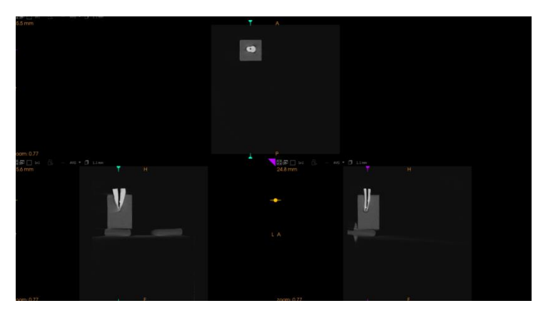
Figure (1): CBCT image of sample after retreatment with EdgefileXR Files