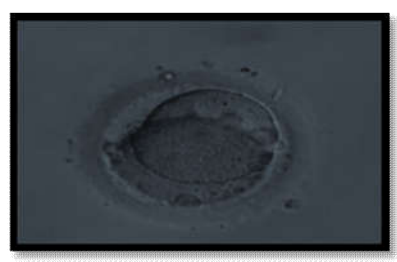
Fig .1 Two cells

Different small letters vertically denote significant (P<0.01) different between parameters