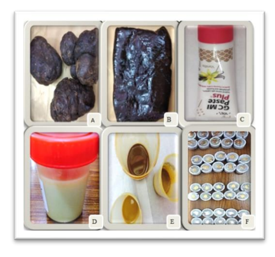
Figure (1): Formulation & Application of Tooth Coating Cream, (A) Crude Propolis, (B) Aqueous Extract of Propolis, (C) MI Plus Paste, (D) AEP-MI Plus Paste Complex After Mixing, (E) AEP-MI Plus Paste Complex After Freeze Drying, (E) Application of Different Tooth Coating Creams.

the base solution, then propolis extracts 30% were added after complete dissolving in ethanol, shake well via vortex tube stirrer then placed in the lyophilizer till complete evaporation of the solvent and homogenous cream was obtained for the three types of propolis as shown in Figure (1).