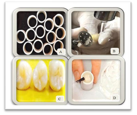
Figure (2): Preparation of Enamel Blocks, (A) Cylindrical Plastic Tubes, (B) Separation Of The Crowns From The Roots, (C) Crowns After Cutting, (D) Cold Cure Acrylic Mold &Varnish Application.

Then smoothed by using the universal polisher machine. Each specimen was then coated under the digital stereomicroscope (X 40) with two layers of an acid - resistant nail varnish, leaving 3\times3mm^2 window on the middle third of the enamel surface to define the experimental area <sup>(19, 20)</sup> as shown in Figure (2).