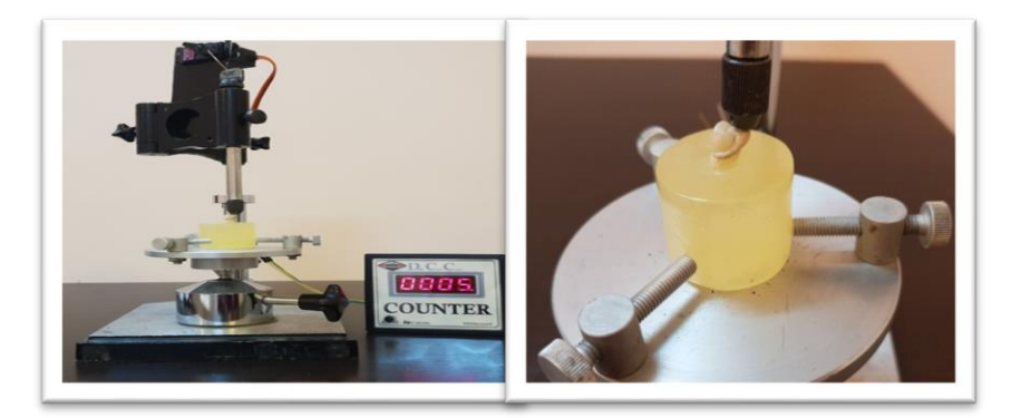
Figure (1): The Clasp on Abutment Fixed on Cycling Machine.

A jelenko surveyor (QD, England) was modified to be similar to a chewing simulator tool connected to a digital counter (4DRCM, China). The e-max tooth with its resin base was retained on the table of the surveyor in parallelism to a path of insertion. The clasp was held in the locking device of the surveying beam. The clasp was removed and reinserted at a speed of 10mm/s simulating the placement and removal of RPD by a denture user (figure1). The study was completed in dry condition and at room temperature (25<sup>o</sup>C).