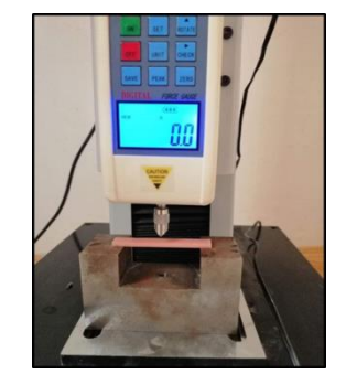
Figure (2): Universal testing machine

S =transverse strength (N/mm2),P =maximum force exerted on specimen(N),I=distance between support(mm),b=width of specimen(mm),d =depth of specimen.