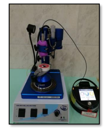
Figure (1): Diode laser handpiece stabilized by milling machine

tip, milling machine (Bio art 1000 Ma/ Brazil) was used to stabilize the laser hand piece with the aid of condensation silicone impression material (DUROSIL L/ Germany). The milling machine permitted only the horizontal movement of the laser hand piece during the irradiation to ensure that all the specimens were lased in a similar manner (Figure 1). The laser irradiation was performed at 2Watt power parameter for (C2 and L2 groups) and 4Watt for (C4 and L4 groups) with continuous-wave mode. The irradiation time was 15 seconds <sup>(13)</sup> during which the treatment area was irradiated for three times during the 15 seconds period with uniform scanning motion over the entire target area in inciso- cervical direction.