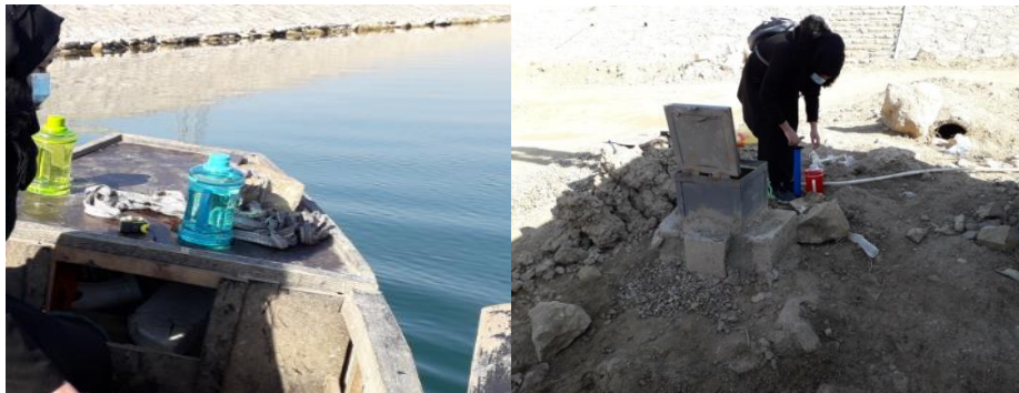
Fig. 2. Water extraction process from three wells and AL Warrar canal

Depending on the data of three wells drilled in the right bank to Al Warrar canal in Al-Ta'meem district. 95 water samples of the same depth were collected from five different sites (19 samples each). The sample collection procedure conducted on January/ 1 st 2021 between 11 and 12 pm. The five sites were distributed as follows: three of these sites are wells that have been drilled, and the other two sites are in the middle and on the canal bank. Sample storage was done by using high-quality plastic bottles tightly closed and kept at 4^{\circ}\text{C} before the test process. These samples tested in the laboratories of the Science College, Fig. 2.