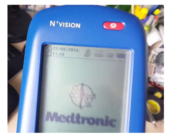
Figure 1-1: The 8840 N'Vision programmer .