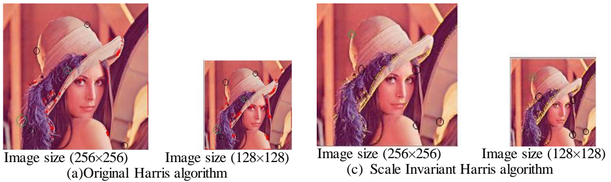
Figure 2: Missing Corner(s) in Lena image