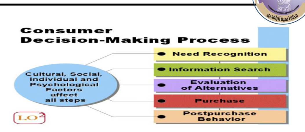
Figure 2 shows Consumer buying decision process

Source: Qazzafi, Sheikh., 2019, consumer buying decision process toward products, international journal of scientific research and engineering development—volume 2 issue 5, sep – October 2019 available at <u>www.ijsred.com</u>.