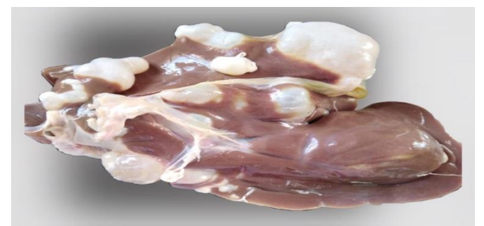
Figure1 : Hydatid cysts in the liver of sheep

The infected livers of sheep (figure 1) were collected from butcher shops in Mosul city and protoscoleces of E. granulosus were isolated according to Smyth [21] by sterilizing the surface of hydatid cyst with 70% ethanol following by aspiration of hydatid cyst fluid using G21 needle. Protoscoleces were washed three times with phosphate buffered saline (PBS) using centrifuge at 3000rpm for 10minutes, with the addition of 1gm of streptomycin and 20000 UI of penicillin before starting a second wash.