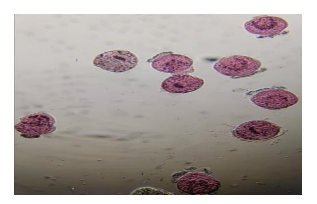
Figure 3 : Dead protoscoleces after treated with extract and dye it with 0.1% eosin