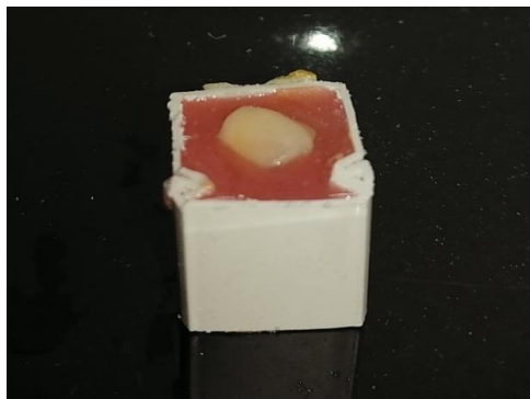
Figure (1) : Tooth specimen embedded in acrylic block

carefully cleaned by water and toothbrush to remove deposits of calculus, plaque, or debris and stored in 2% thymol until the experiment (a maximum of one month) the teeth were rinsed completely in the tap water and examined under a \times 20 magnifier to reject those with structural faults and were kept in the distilled water at room temperature for a maximum of one week (8) . The teeth samples were divided randomly into 4 main groups (n:10). The root portion was separated and removed using diamond disc bur with water whereas the coronal portion was conserved, so we choose the flattest area of the buccal of each tooth was tested (9) . Each tooth specimen was inserted in an acrylic block , which has been prepared by pouring acrylic in the mold of the polyvinyl cube (trunk tray cable) , the flattest area of the buccal crown portion made parallel with acrylic level, when the cold cure acrylic resin set for all specimens, they were arranged into study groups, figure (1).