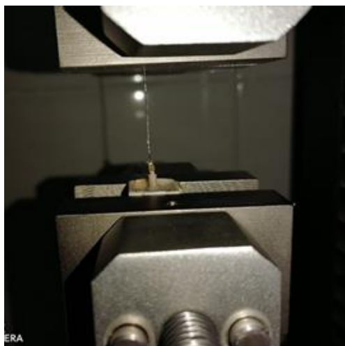
Figure (4): Sample testing using UTM