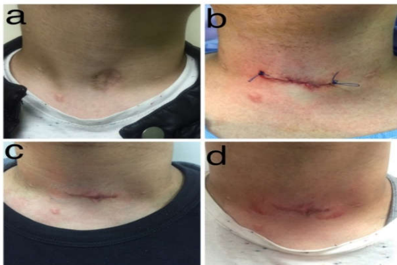
Figure(3) :pre and post-operative photographs of a 16 years male patient with post tracheostomy scar of 4 years duration.