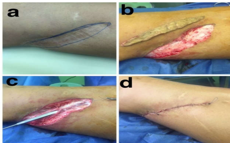
Figure (2): Operative steps in creating the dermal tube.