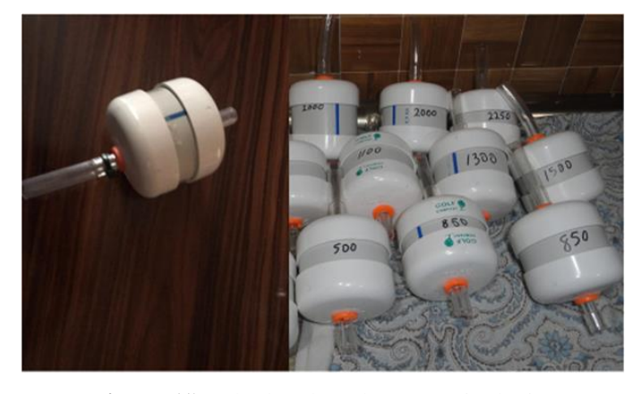
Figure (1): The local made magnetic device

The tap water was magnetized by a locally made device at different magnetic strengths; where a Pyrex-type laboratory glass tube (12) cm in length and 13 mm in diameter) was taken and two magnetic pieces were installed on the outer diameter of the glass tube and it was of neodymium type. To prevent the tube from being broken and preserve the magnetic piece, the sides of this tube were covered with a locked casing designed for this as well perforating the middle of this cap to pass the sides of the glass tube through it and fix them by the handbag, and several devices were made with different magnetic strengths of 500,850, 1500, 1900 Gauss. The magnetic device was shown in (Figure 1).