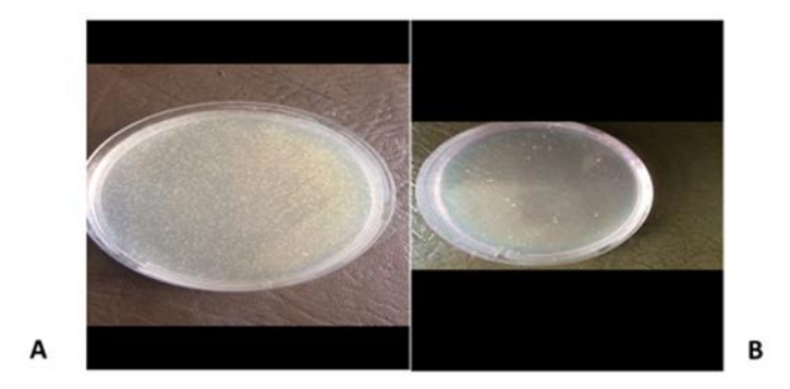
Figure (2): Effect of magnetic water with 500 Gauss magnet device on salivary bacterial count(A:befor use, B: after use)

The number of colonies decreased in the samples of saliva after irrigation with magnetized water with all strengths, especially