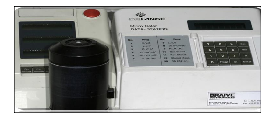
Figure (1): Dr. Lange Micro Color: color measuring device.

Afterwards. access and step-back instrumentation with K-files (Maillefer, Detrey/Denstply, Zurich, Switzerland) were performed on all teeth using 5% NaOCl as an irrigant and canals were dried thoroughly with paper points and temporization was performed with a dry cotton pellet and cavit. The teeth were randomly classified into four groups (n=10 per group). The teeth were kept in wet condition. After 1-week storage, the root canals of the teeth were filled with a sealer and gattapoints employing percha the lateral condensation technique. The sealer used were: Sealapex (Sybron-Kerr, Romulus, MI, USA) in the first group, Roth's 801 (Roth's International, Chicago, IL, USA) in the second group and AH-26 (DeTrey/Dentsply, Zurich, Switzerland) in the third group. In the fourth, no sealer was used (control group). The sealers were used according to the manufacturers` recommendations. The sealers were placed in the root canals by coating, inserting and spinning a lentalo file counter clockwise. Sealers were also placed on master cones;