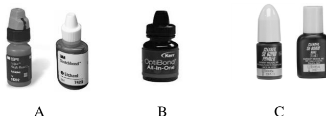
Figure (2): Adhesive systems used in the study: a) Adper Single Bond 2 Adhesive; b) OptiBond All In One adhesive; c) CLEARFIL SE BOND adhesive.

Group III: Cavities were treated with two step self-etch adhesive system.