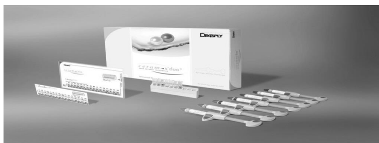
Figure (3): Resin composite restorative material used in the study.

Austeria). The intensity of light monitored with curing radiometer (Cromatest 7041-Megaphysik, Germany). Restorations were finished and polished using finishing disks of composite (KENDA DENTAL POLISHERS, Liechtenstein) from tooth surface toward restoration direction for 5 minutes. Table(1) show the composition of the materials used in the study.