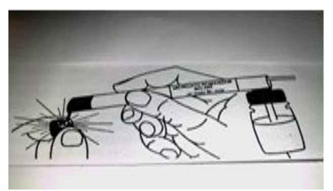
Figure (2):Represent surface operated with microblaster.