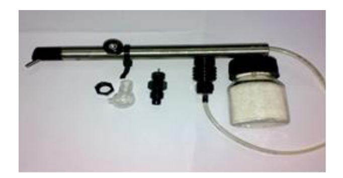
Figure (1): Microblast.

Group 3 : Sandblasting + silanization. After sandblasting with alumina particles 50-\mu m , coupling agent was applied ,mix the BIS-SILANE by dispensing one drop from each of the two bottles (parts A&B)into a mixing well .Brush on 1-2 coats and wait for 30 s. Then, the specimens were divided into two subgroups (n=5) according to the cement types(self adhesive resin cement and Rinforced glass ionomer cement).