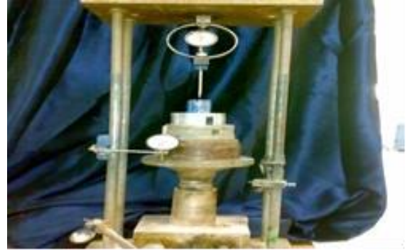
Figure (3): Universal Testing Machine (Soil Test Co. Inc., ILL. USA)

Figure 3 shows the shear bond testing machine, which is present in mechanic engineer collage.(Soil Test Co. Inc., USA) with a Knife edge head placed at the interface between zircon block and composite block at a cross head speed of 0.5mm/min (21).The force at separation (N) was divided by the cross section area (100mm2)to provide results in units of stress(MPa). The failure e mode examined by a stereomicroscope (Zeiss, MC 63A, Germany) at 20X magnification power.