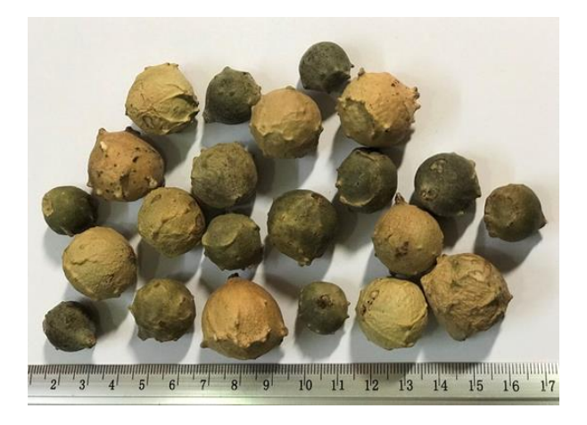
Figure 1: Q. infectoria Olivier (Fagaceae) galls.

Q. infectoria galls are vegetable growths formed on twig of Q. infectoria tree, the galls are globular in shape and from 1.2 to 2.4 cm in diameter (Figure 1). The galls were collected locally from Gara mountain in Duhok province of Iraq in October 2016. The collected galls were washed with tap water and dried by air at home; then stored in a paper sack and kept at room temperature until use. The used galls were authenticated by Professor Saliem E. Shahbaz a taxonomist in Department of Forestry, College of Agricultural Engineering Sciences, University of Duhok, Iraq.