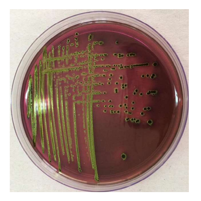
Figure 1: Presumtive E. coli in EMBA media with the metallic green color.

The ESBL confirmation test of the E. coli isolates using DDST and VItek-2 methods. In this method there were three positive samples of ESBL 6% (Table 1). In the DDST method there is an enlargement zone with the synergy pattern of the three antibiotics with amoxycylin-clavulanate as its inhibitor (Figure 2).