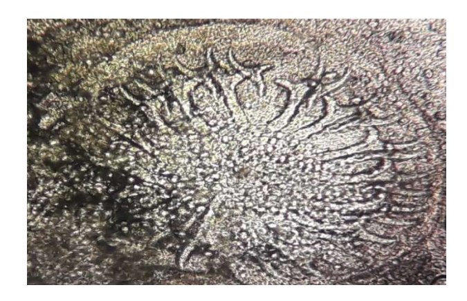
Figure 3: Rostellar hooks with small and large hooks are seen.

The average size of the protoscolices ranged from 0.45 to 0.6 \mu m the protoscolices have 4 suckers and rostella hooks, numbered 24-32 it has same number of large and small hooks (Figures 3 and 4). The length of large hooks ranged from 170 to 190 \mu m while the length of small hooks was 80 to 120 \mu m (Tables 3 and 4).