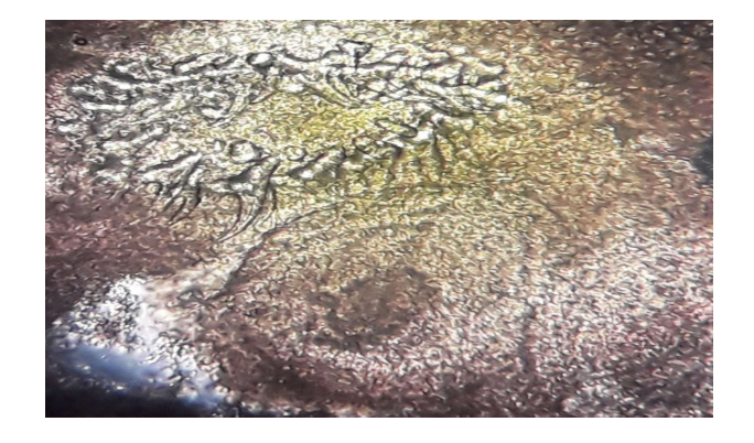
Figure 4: The protoscolex has rostellar hooks and suckers.