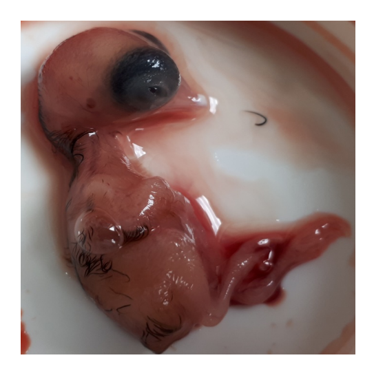
Figure 5: Chicken embryo in 4<sup>th</sup> passage showing dwarfism retardation of growth.