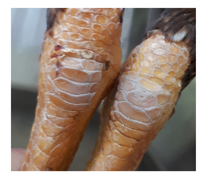
Figure 2: A 26 weeks old egg laying hens showing swelling and edema in hock joint.