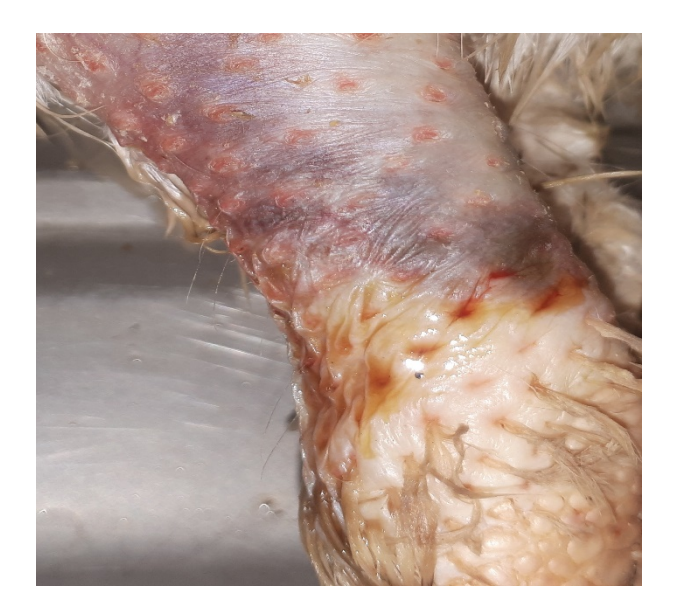
Figure 1: A 20 weeks old egg laying hens showing edema and hemorrhage in the leg.

The result shows no lesions was recorded in 1^{st} passage, then 2^{nd} and subsequent passage revealed lesions which include petechial hemorrhage under the skin, dead of embryo with dwarfism, these lesions increase in severity in the later passages with decrease in embryo death time and increase of virus titer (Figures 4-6) (Table 1).