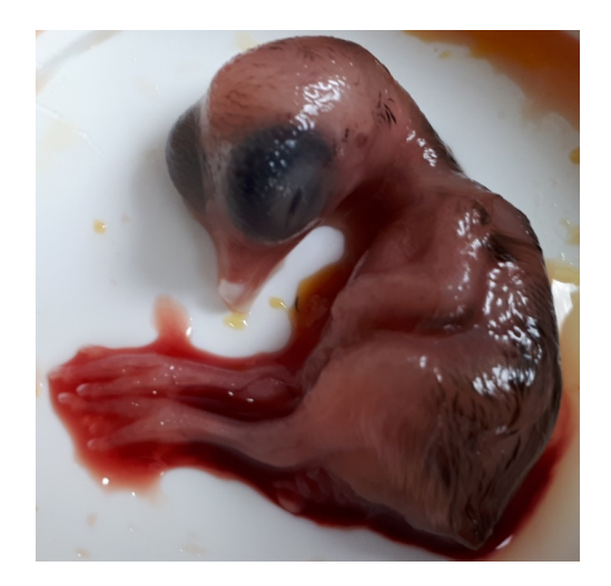
Figure 6: Chicken embryo from control group.

Figure 5: Chicken embryo in 4<sup>th</sup> passage showing dwarfism retardation of growth.