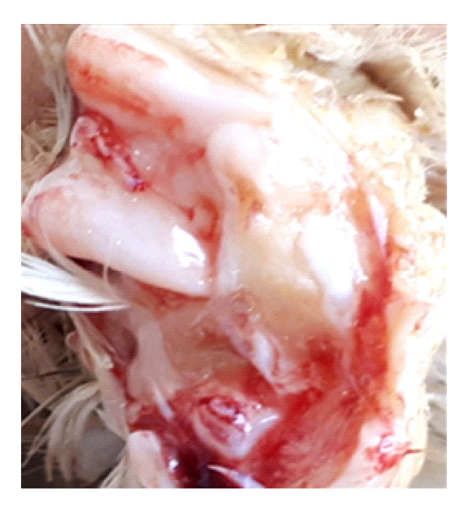
Figure 3: A 33 weeks old egg laying hens showing increase the volume and change in color of synovial fluid of hock joint.