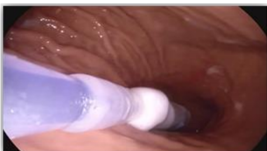
Figure 1: Adjustment of collapsed balloon at antrum.

***unsatisfactory result means loss of less than 14% from original weight.