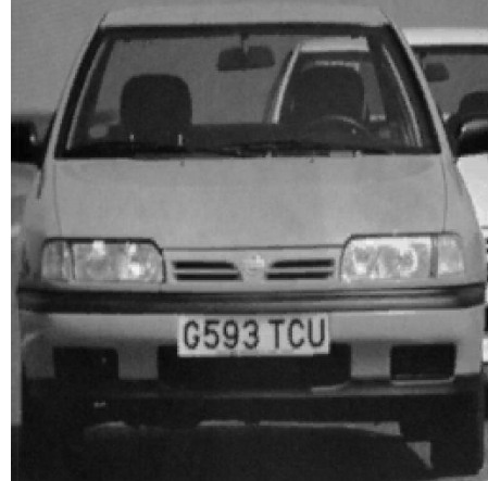
Figure 4: (a) Source Car Image