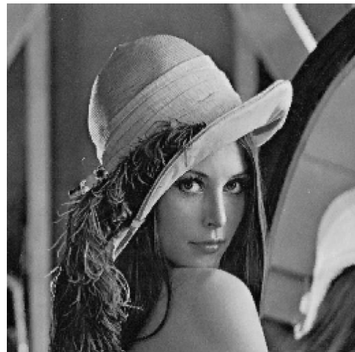
Figure 2: (a) Source Lena Image