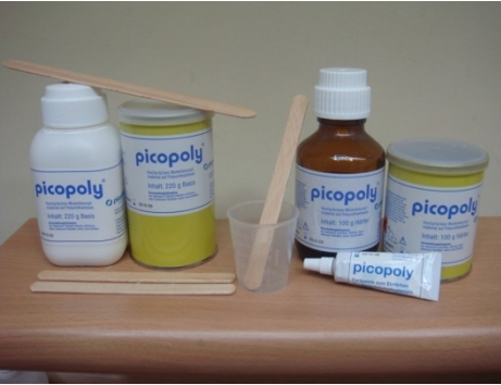
Figure 92): Picodent resin stone.