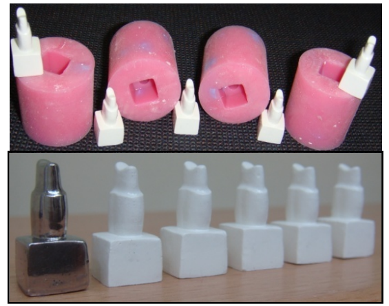
Figure (3): NiCr die with resin stone dies.