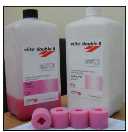
Figure (1): Elite double 8, Zermack impression material.