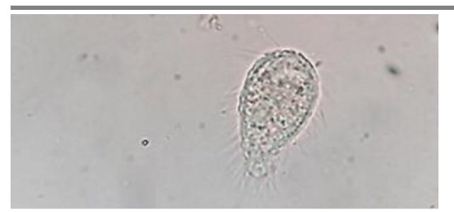
Figure,1: Trophozoite of B. sulcata in sheep drinking water in direct wet film (100x).