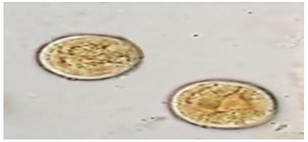
Figure, 3: Cyst of B. sulcata in sheep fecal sample (in direct wet film (100x).