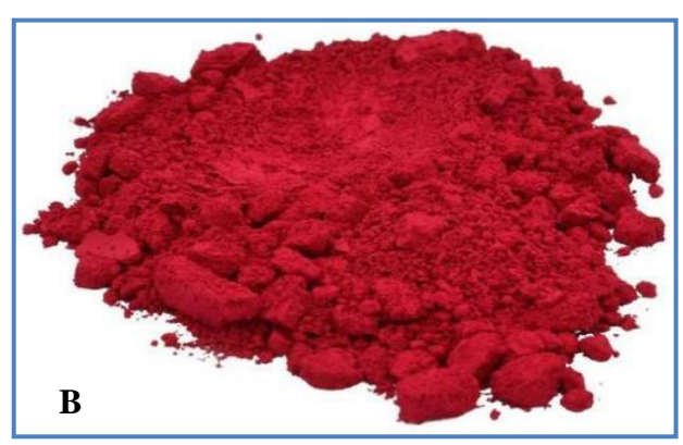
Figure, 1A and B: Chemical structure (A) and powder (B) of Azorubine (3 and 8).