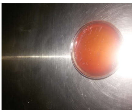
Figure(4) growth on blood agar