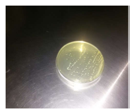
Figure(3) growth on nutrient agar

The growing of bacteria was identified as Staphylococcus aureus . On the nutrient agar, it appeared as a spherical in shape with smoothly surface Fig. 3. On the blood, it is appear as glistening, smooth, entire, raised, translucent colonies Fig. 4 while Fig. 5 the mannitol agar, growing of bacteria are glistering stained in a golden yellowish appearance. As a result of isolated samples, 14 of 80 cattle being sampled found to be positive on the agar growing cultures.