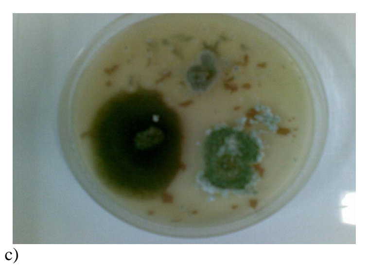
Figure (1) : a) Growth control of Trichoderma harzianum . b) growth control of Alternaria alternata . c) Atagonistic interaction of T. harzianum with Alternaria alternata (left of plate) and Macrophomina phaseolina (top of plate).