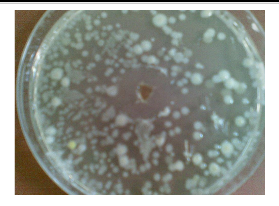
Figure (2) : Antibacterial activity of T.harzianum crude extract against Bacillus spp.

It was noticed from table (1 and 2) that the crude extract of the fungus T.harzianum showed a wide and different range of antifungal activities against different types of plant and human pathogenic fungi, also against different types of Gram positive and negative human pathogenic bacteria, and we recommend further studies to test the antimicrobial activity of the T. harzianum and its extract against other different fungal and bacterial pathogens, and to characterize the nature of the antimicrobial compound (whether it is protein or not) using different analytical methods such as mass spectrophotometry, gas chromatography (GC), HPLC, FTIR, etc.. for industrially and commercially production of this antimicrobial compound that could represent a potent alternative to the artificially chemical antimicrobial products that have side effects.