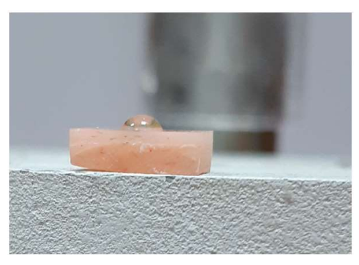
Figure (1): Drop of deionized water on flexible denture base sample

Statistical analysis to the data was performed by the use of one Way Analysis of Variance, Duncan Multiple Analysis Range Test and T test.