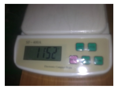
Figure (1): A locally constructed digital biting force measurement device.

A total of 6 patients (2 men, 4 women) with mean age of 65 years old who wore complete maxillary and mandibular dentures. The study was approved by the Ethics Committee of the Faculty of Dentistry. Inclusion criteria were: conventional maxillary and mandibular complete dentures worn for at least 1 year; demonstrating good acceptance of complete denture treatment following a standard period of adaptation and adjustment; not being a denture adhesive user; no known allergy to denture adhesive; no any uncontrolled medical problem, and no any oral condition that might interfere with the research.<sup>(14)</sup> The maximum incisal bite force of the complete dentures was assessed without and with application of the denture adhesive, using a locally constructed digital biting force measurement device which record the incisal bite force in Kg. An electronic kitchen scale (SF–400, China) was modified by an experience technologist. He took the sensor bar outside the electronic scale and join it to a thin metallic foil to be more suitable to use as a sensor biting bar by the patient during study (Figure 1).