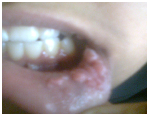
Figure 2: Multiple normal colored, (0.2-4mm) nodules scattered on lip mucosa.