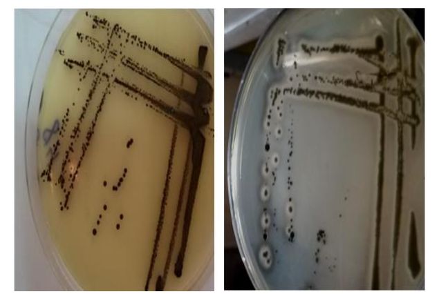
Figure 1. Staphylococcus aureus isolates on Baird-Parker medium

The results indicated that out of 84 isolates, 61 (72.6 %) were identified as S.aureus and 23 (27.3 %) were identified as Coagulase Negative Staphylococcus (CoNs), Vitek2 was employed for the result confirmation, the card for detection of gram positive bacteria. Regarding the source of samples and the isolated Staphylococcus spp., the results appeared as follows: out of 120 nasal swabs, 30 was CoPS and 13 was CoNS; for the 130 burn swabs, 31 was CoPS, and 10 was CoNS as showen in table (1).