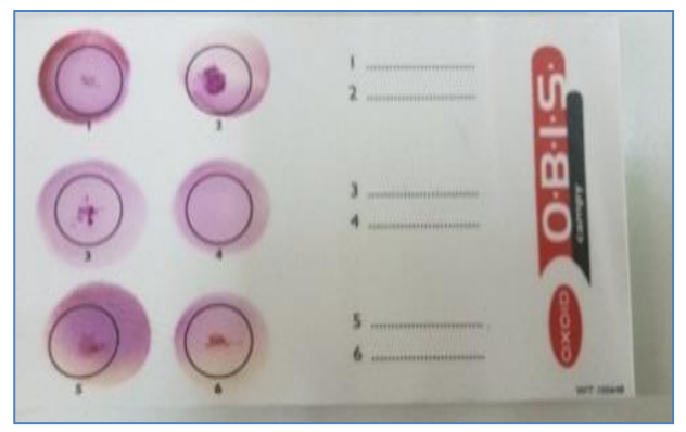
Figure, 3: Oxoid biochemical identification system campy (3, 4.5 No) colorless of colonies indicate the organism is Campylobacter spp.