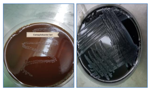
Figure, 1: Growth of Campylobacter spp on selective Preston and MCCD mCCDA plat.

jejuni and negative for C. coli and C. Lari (Table, 1).