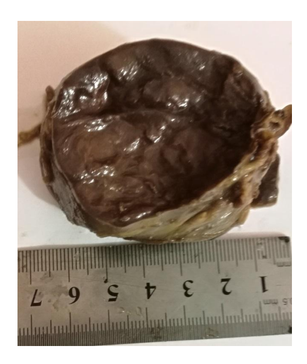
Fig 1. Macroscopic appearance of the mass with smooth outer surface and lobulated brown cut surface.

calcified areas (Fig-1). The histopathological examination revealed cellular proliferation of numerous myeloid and erythroid cells with several megakaryocytes (Fig-2). Immunohistochemical stains for megakaryocytes, myeloid and erythroid linages were positive. The pathological diagnosis was extramedullary hematopoiesis in the right adrenal gland.