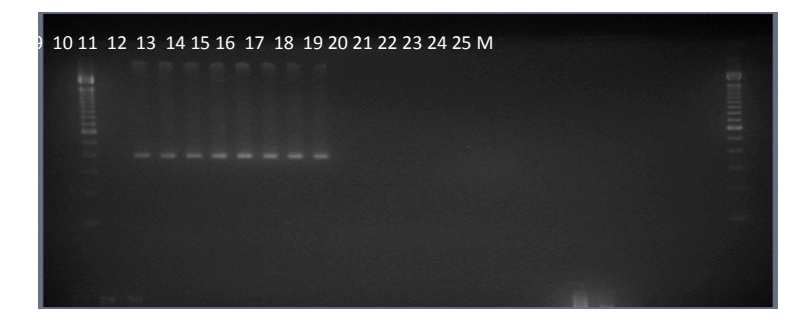
Figure 3. Agarose gel electrophoresis of PCR amplified products using specific primers, VPHK1 and VPHK2. Lanes M, 100-bp molecular mass marker. a Lane 1-12 clinical V. parahaemolyticus ; Lanes 13-24 environmental V. parahaemolyticus ; Lane 25, negative control; b Lane1, negative control; Lanes 2-5 clinical; Lanes 6-9 environmental V. parahaemolyticus ; Lanes 10-25 other species.