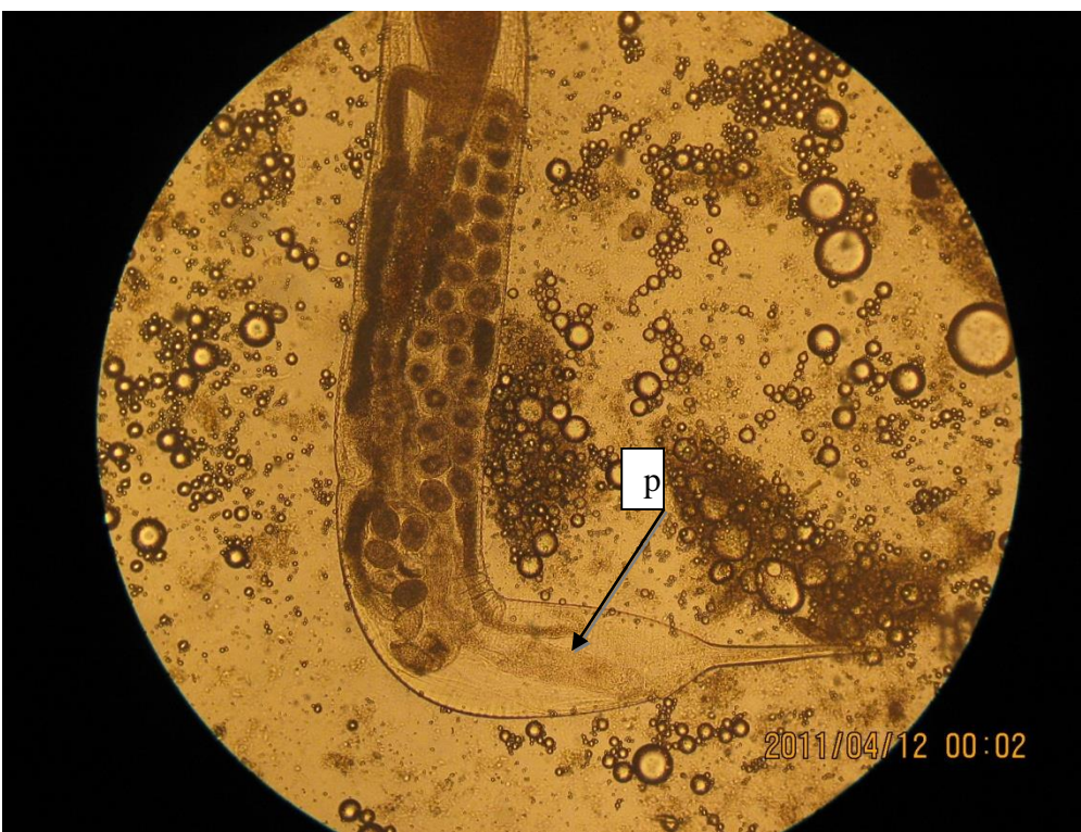
Fig. 6: Adult female of Thelastoma sp. (posterior end). * p: posterior end , An: anterior end