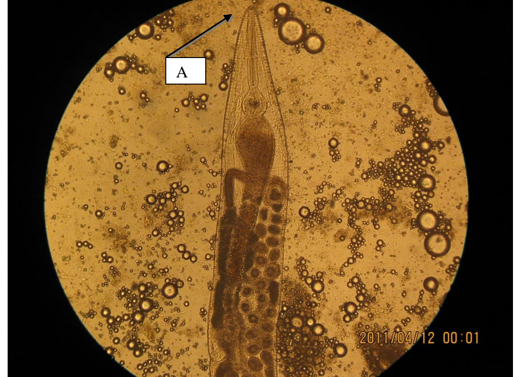
Fig. 5: Adult female of Thelastoma sp.